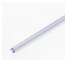
security rod (00806)