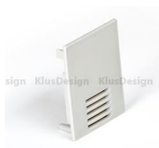
end cap IDOL (24012)