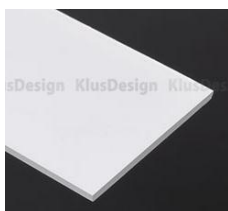
cover type HSP47 frosted (17051) transparent (17062)